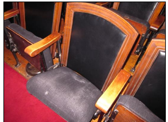
Left Room 114 Reinforcement on some seats, partial reinforcement on others, and still no reinforcement on others