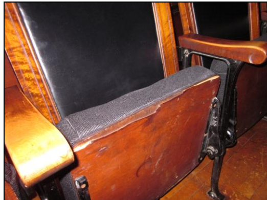
Right Room 114 Worn upholstery